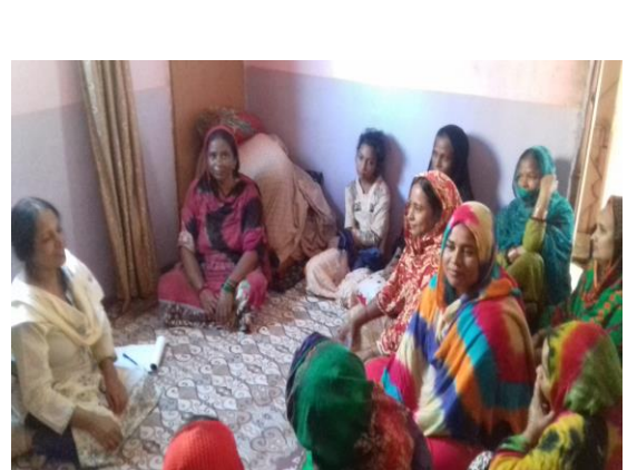
Meeting with a new women saving group organized at Baloch Colony, Orangi Town