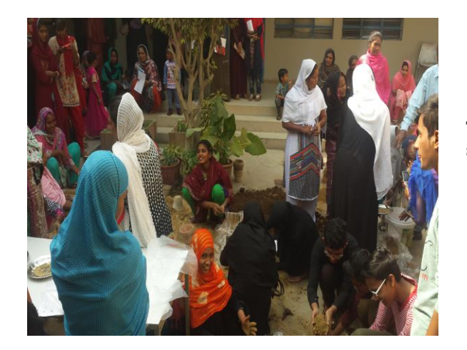
Training of kitchen gardening among women saving groups organized by OPP-RTI