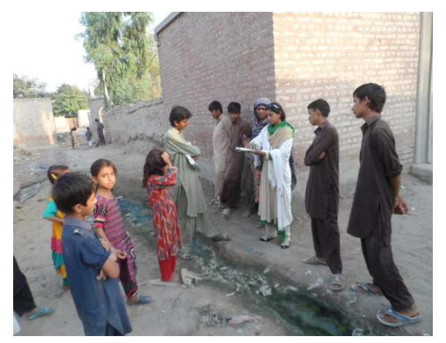
GDO-Keror Lalisen Mapping and documentation of Basti Surjani