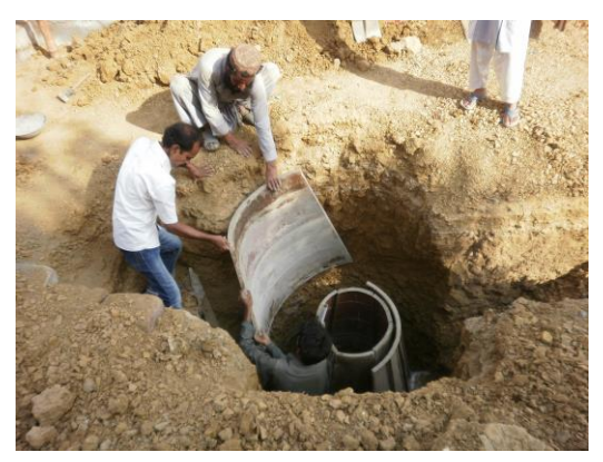
Internal development: construction of lane sewers on self-help in Orangi Town continues, techincal support is provided by OPP-RTI