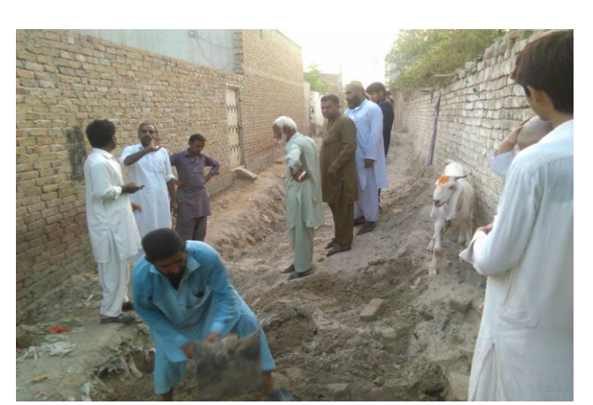
CDSP- Uch Sharif Supervision of a lane sewer being laid in Uch Gilani