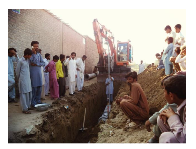
HAMET- Bhawalpur External work on main sewer carried out by Government supervised by Hamet's team