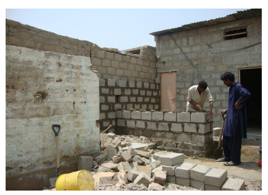
A unit being supervised by TTC in Orangi Town