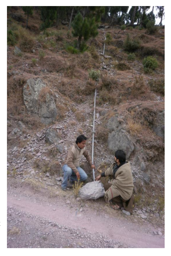
KWDP-Balakot, KPk OPP-RTI's team monitoring KWDP's work on the water main line laid on self-help