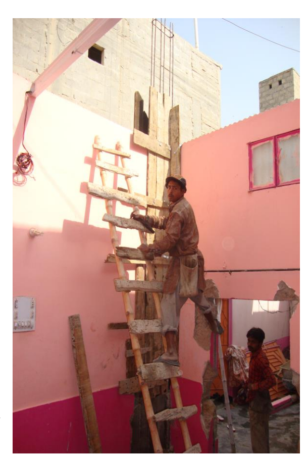
Construction of RCC structure in Orangi Town thru HSL&P supervised by TTC