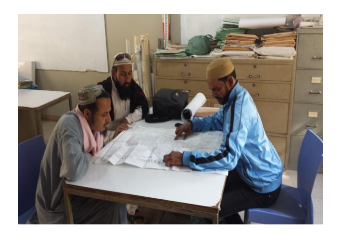
Activists from Meer Mohammad Goth, UC-8, Gadap Town, to discuss map of their area